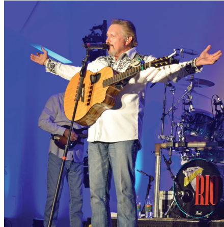
Marty Roe and the rest of Diamond Rio entertain the crowd at the Salem Civic Center.