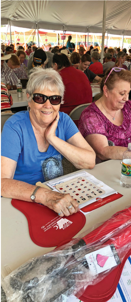
Annual Meeting attendees play bingo under the tents on the Fulton County Fairgrounds.