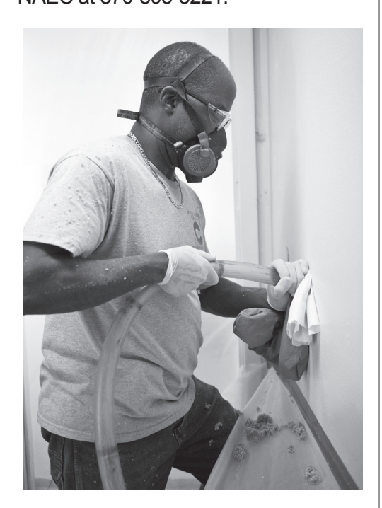
An Energy Efficiency Conservation Loan can pay for weatherization measures, including insulation in walls.

For more information, please call NAEC at 870-895-3221.