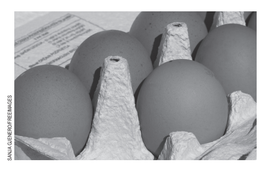
The USDA recommends discarding eggs after an extended power outage.

A monthly publication of North Arkansas Electric Cooperative