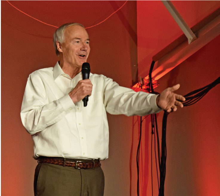
Gov. Asa Hutchinson speaks during the Annual Meeting business session in the Salem Civic Center on June 7.