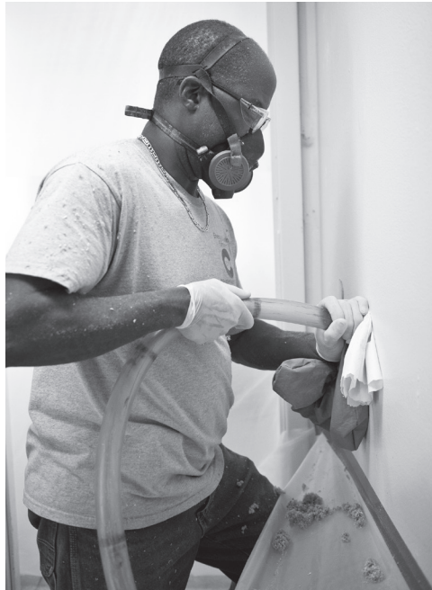
An Energy Efficiency Conservation Loan can pay for weatherization measures, including insulation in walls.

For more information, please call NAEC at 870-895-3221.