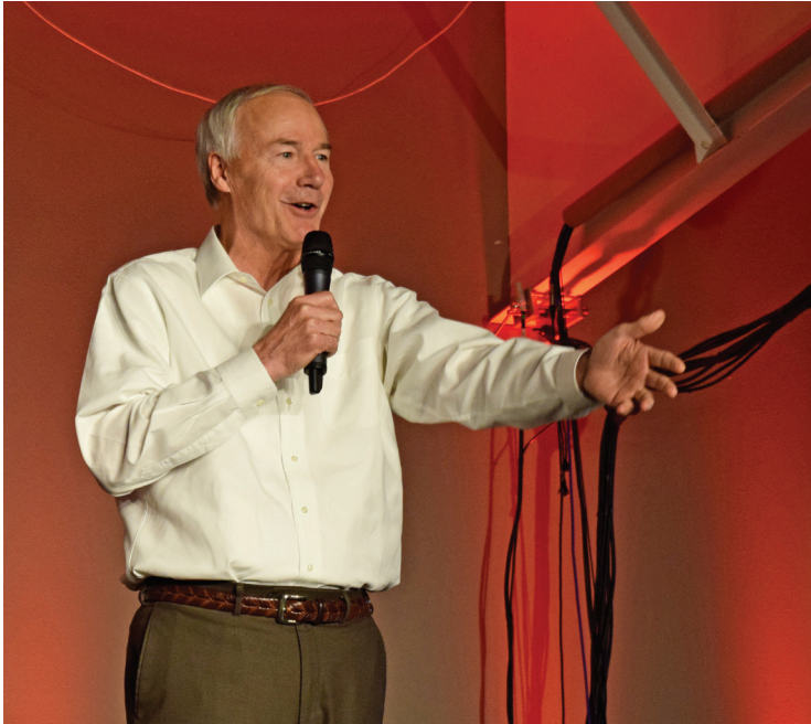
Gov. Asa Hutchinson speaks during the Annual Meeting business session in the Salem Civic Center on June 7.