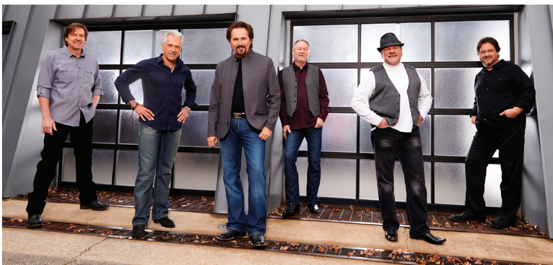
Diamond Rio will perform at NAEC's Annual Meeting on June 7.