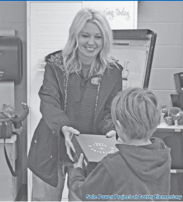
Sole Power Project at Cotter Elementary