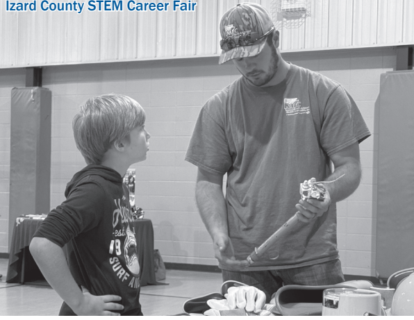
Izard County STEM Career Fair

North Arkansas Electric Cooperative operates as a not-for-profit business. Because of that, our board of directors and employees are motivated to serve our members, not out-of-state stockholders.